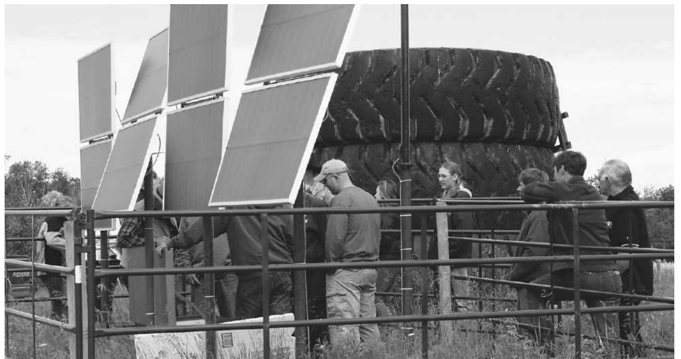
■ FARMING INNOVATION — (Above) Powered by eight solar cells, Luke Tellier's new watering system can sustain up to 600 heads of cattle's watering needs. (Below) Luke Tellier, left, gives a fellow farmer a tour of his high tech cattle watering system, a partnership with Ducks Unlimited Canada.